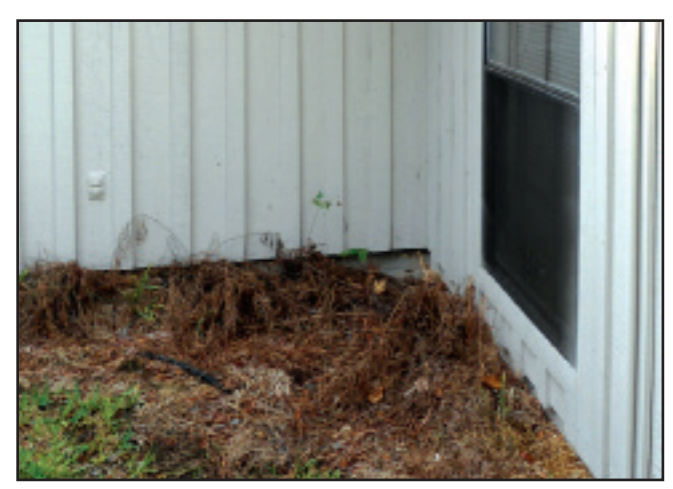
Inside corners can harbor embers.

Visualize if there is anything that can burn easily. Look for the little things: Dry grass growing up against or leading to the foundation, dead vegetation underneath bushes and shrubs, a woodpile next to the home or on the deck, patio furniture cushions, etc.