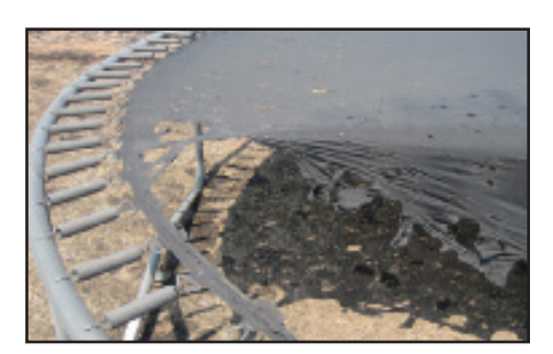
Embers destroyed this trampoline.