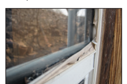
Embers landed on this window.

Inspect your home where embers may land or hide. Remove the debris and make the area Firewise. Communities are safer when they work together. To learn more about becoming a Firewise Community, visit www.firewise.org.