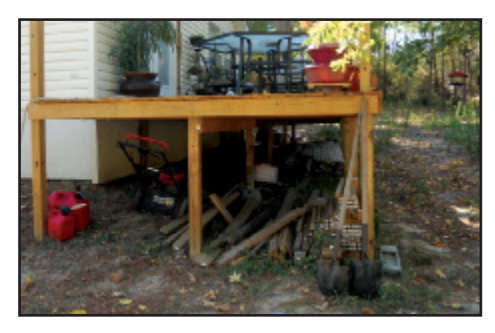
Embers landing on this wood could set your deck on fire.