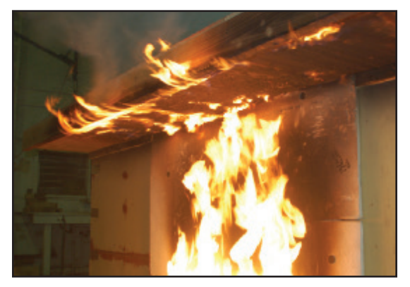
Embers from flames can find their way into your attic through unscreened vents.

Dormers, split-level roofs and lots of nooks and crannies create the perfect nest for burning embers. Pay particular attention to any and all inside corners. Wherever possible, cover those corners. Metal flashing is very effective.