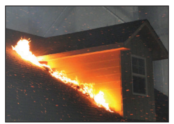
Debris can build up in corners, providing fuel for embers.