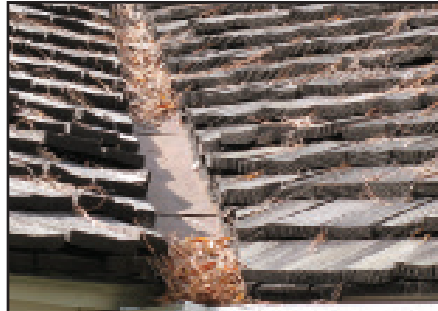
Embers could ignite these needles.