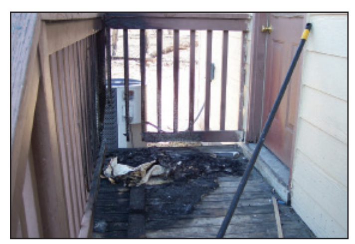
This photo shows damage to a wooden deck from embers.